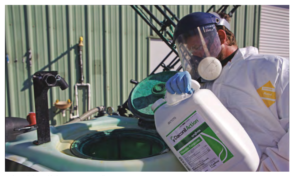
After identifying target diseases on your course, make a list of all the fungicide classes and active ingredients for control of each disease, and be sure to include the FRAC number for each fungicide.

management practices, target pathogens and product selections — in one place and order it in a logical sequence. By getting your thoughts down in a document, you'll be able to easily review them with an agronomist you trust, as well as with your team.